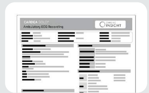
Software Generated Report