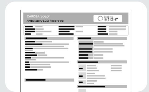
Analysis Package (Smart Cable & Software) Connected to Your PC